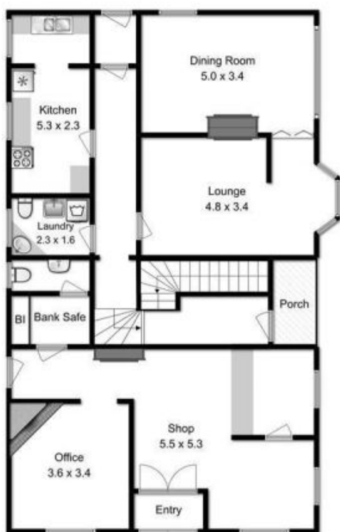
Ground Floor Approx Floor Area 126 Sqm