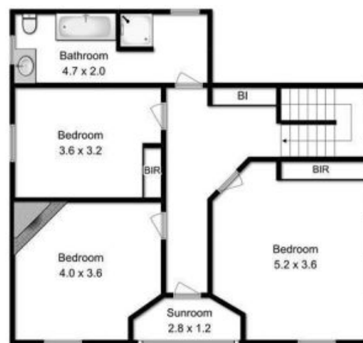
1st Floor Approx Floor Area 87 Sqm