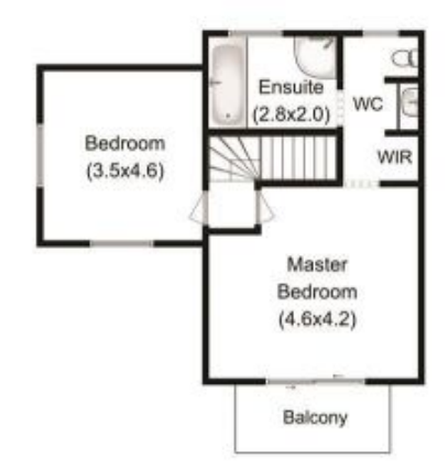
All measurements are internal and approximate. This plan is a sketch for illustration, not valuation. Produced by Open2view.com