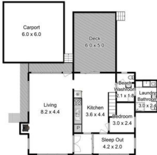
Ground Floor Approx Floor Plan: 98 Sqm

Fixtures and Fittings are for display only and not to scale.