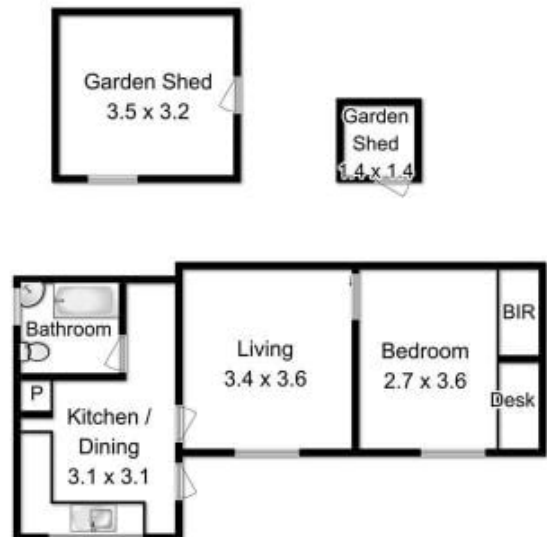
Ground Floor - 45 sqm

Fixtures and fittings are for display only and not to scale. All measurements are internal and approximate. This plan is a sketch for illustration, not valuation. Produced by Open2view.com