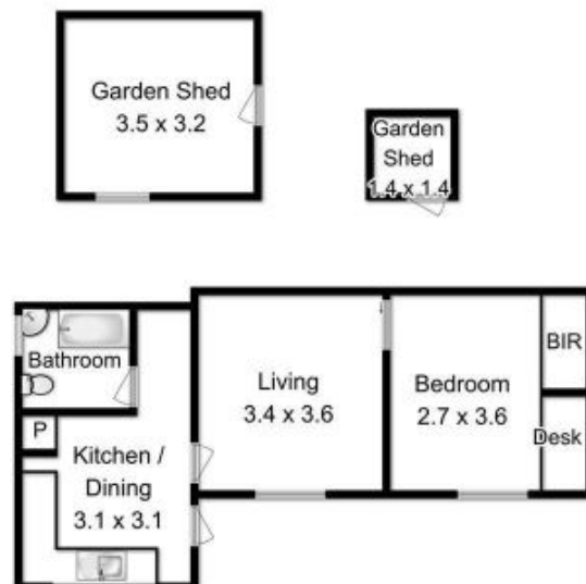
Ground Floor - 45 sqm

Fixtures and fittings are for display only and not to scale. All measurements are internal and approximate. This plan is a sketch for illustration, not valuation. Produced by Open2view.com